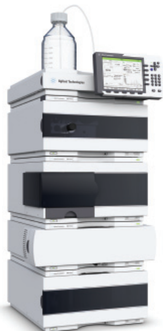
Agilent 1260 Infinity GPC/SEC Analysis System