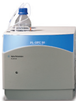
Agilent PL-GPC 50 Integrated GPC/SEC System

The Agilent PL-GPC 50 Integrated GPC/SEC System is a standalone instrument containing all the components necessary for the analysis of a wide range of polymers. With pump, injection valve, column oven and optional degasser, as well as any combination of refractive index, light scattering and viscometry detectors, the PL-GPC 50 is an ideal choice when you are starting out in GPC or want the convenience of a single solution.